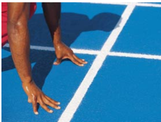
圖2.3 賽跑 Figure 2.3 Race

論文內文中，圖名應置於圖之下方，例如：In the paper, the title should be placed below the graph, for example: