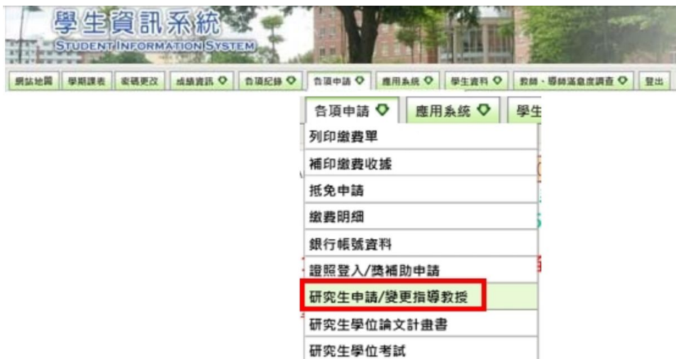
圖二 Figure 2

Please go to "Campus Portal" → "Student Information System" → "Applications" → Click on "Graduate Student Application/Change of Advisor" to proceed with the application (as shown in Figure 2).